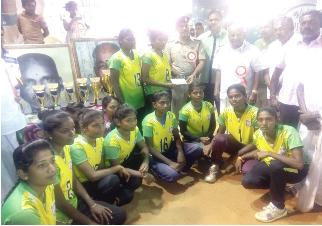
STATE LEVEL VOLLEYBALL TOURNAMENT AT TUSUR NAMAKKAL 15 JAN 2019