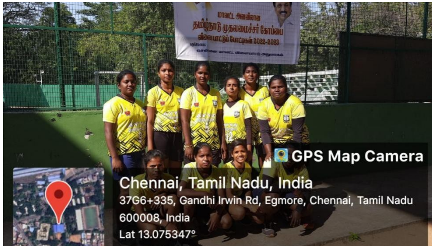
CM TROPHY B TEAM SECURED 4 TH PLACE