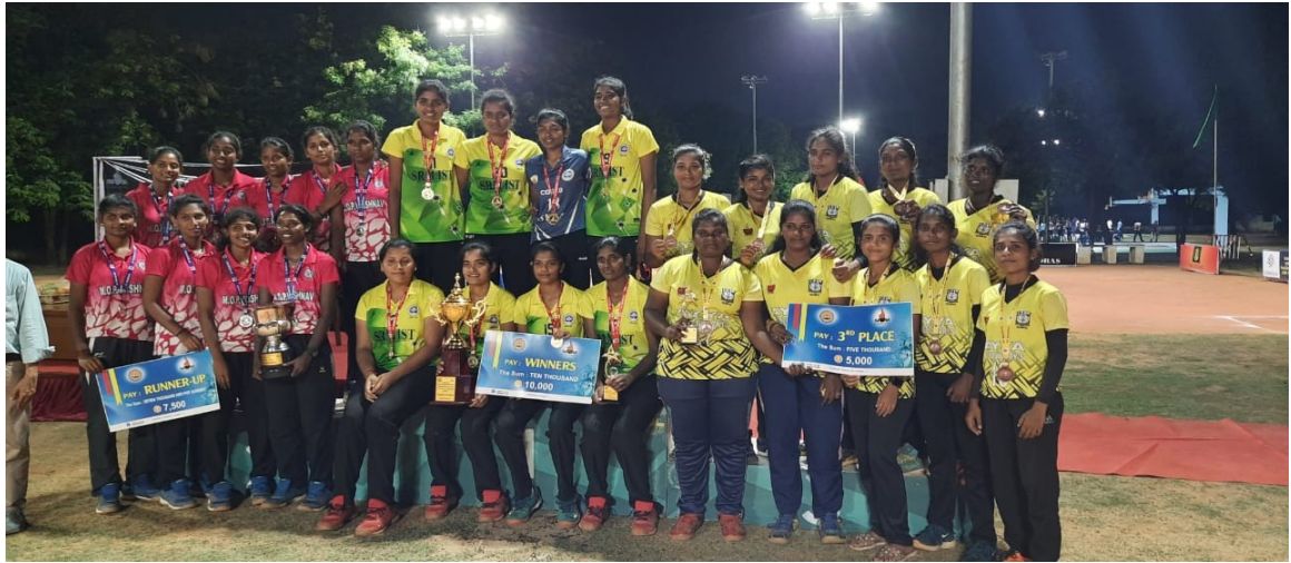
LIFE SPORTS ACADEMY STATE VOLLEYBALL TOURNAMENT SECURED 1 ST PLACE 23 FEB 2023