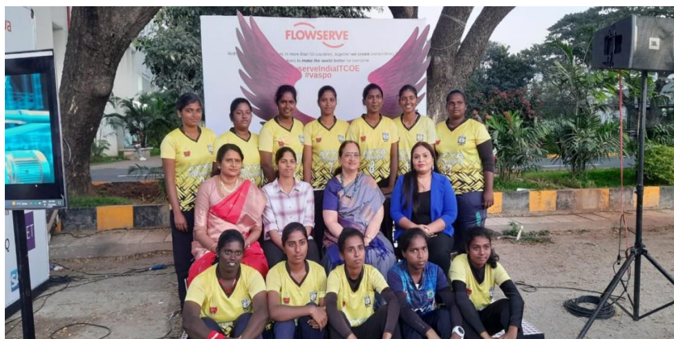
ALL INDIA JIMMY GEORGE VOLLEYBALL TOURNAMENT AT IIT MADRAS SECURED 3 RD PLACE