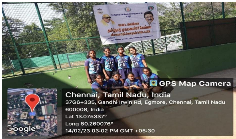
MOP VASCO STATE LEVEL VOLLEYBALL TOURNAMENT SECURED 3 RD PLACE 17FEB 2023