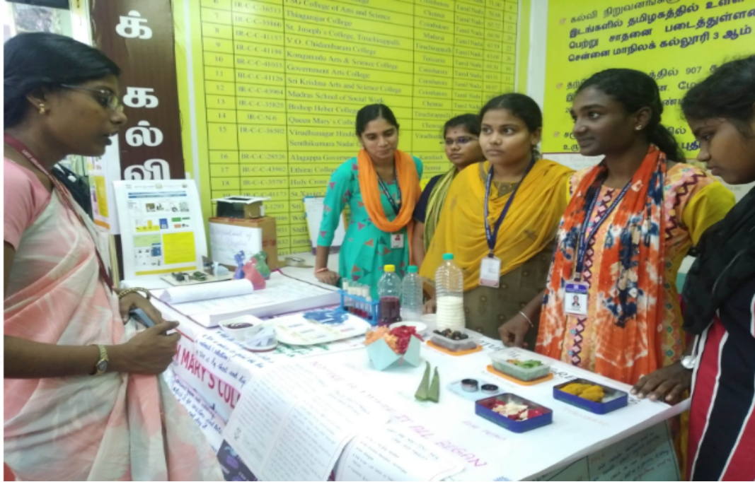
List of students participated in the trade fair exhibition