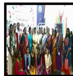
OVERALL TROPHY UG & PG STUDENTS OF HOME SCIENCE ART EX'2024 QMC