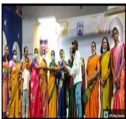
STATE-LEVEL INTERCOLLEGIATE OVERALL CHAMPIONSHIP TROPHY FOR MILLET COMPETITION