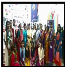
JOYCE SUBRAMANIAN MEMORIAL ROLLING TROPHY FOR HIGHEST PARTICIPATION UG & PG STUDENTS OF HOME SCIENCE ARTEX'2023 QMC